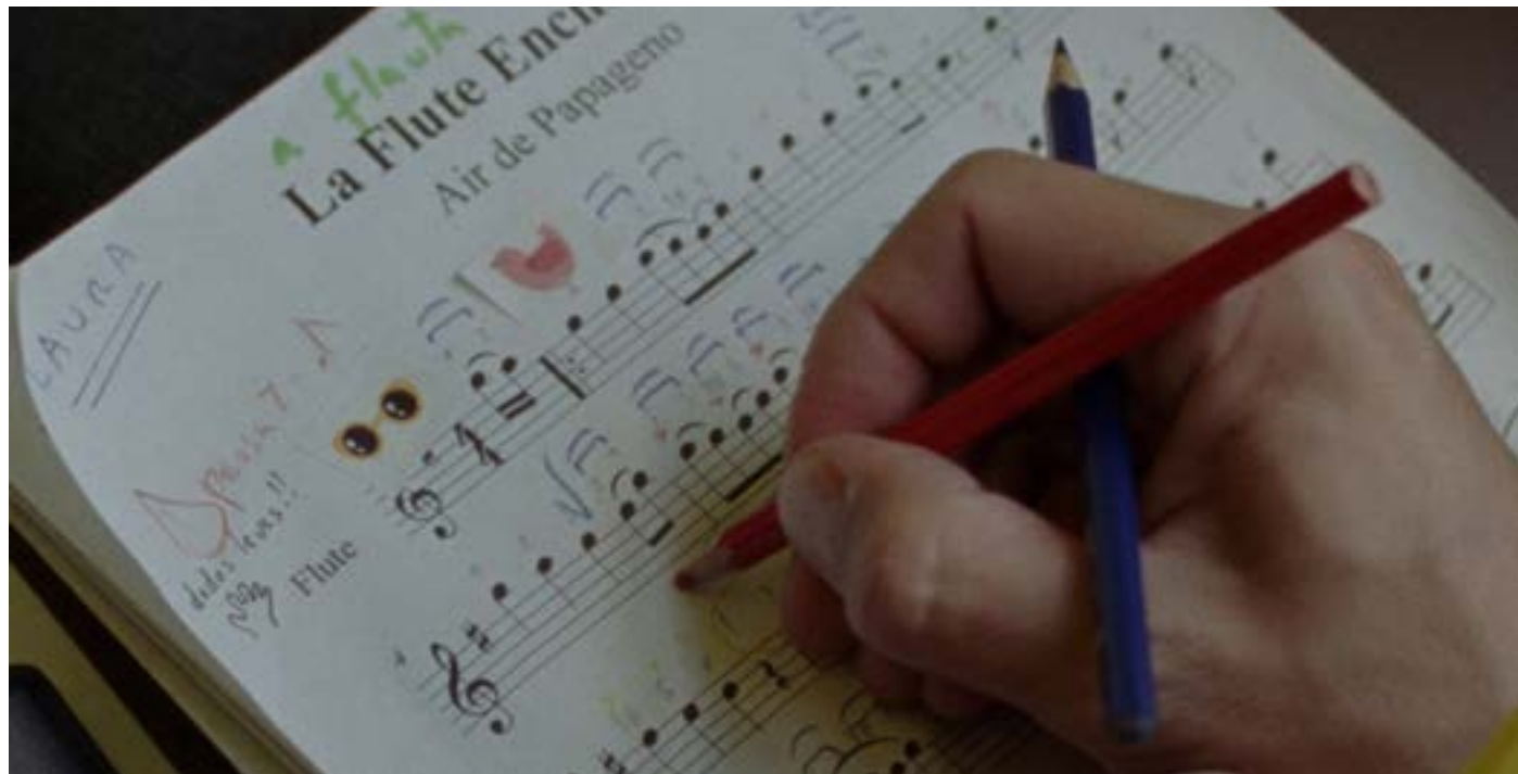
Sol Menor