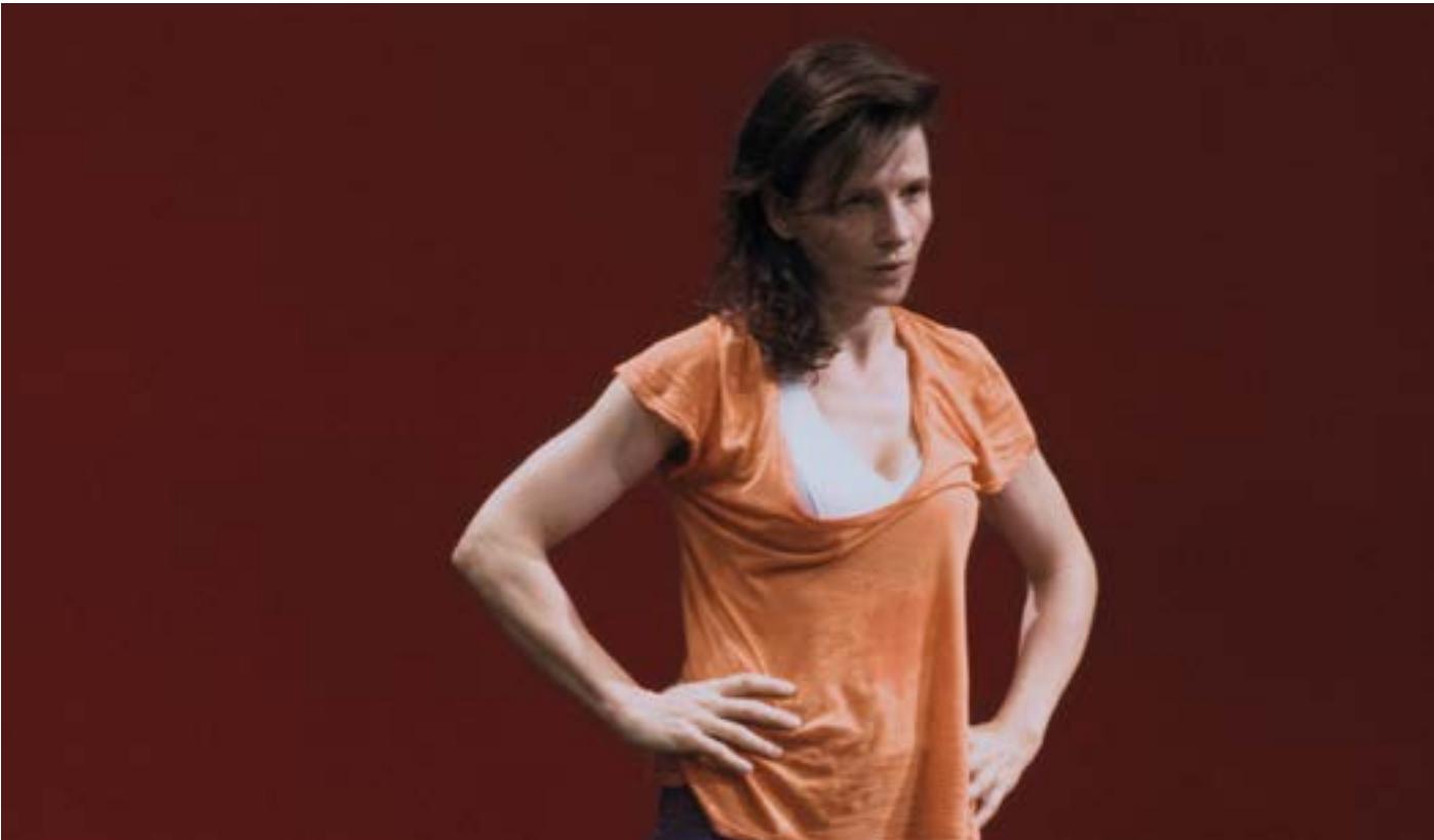
In-I in Motion by Juliette Blnoché