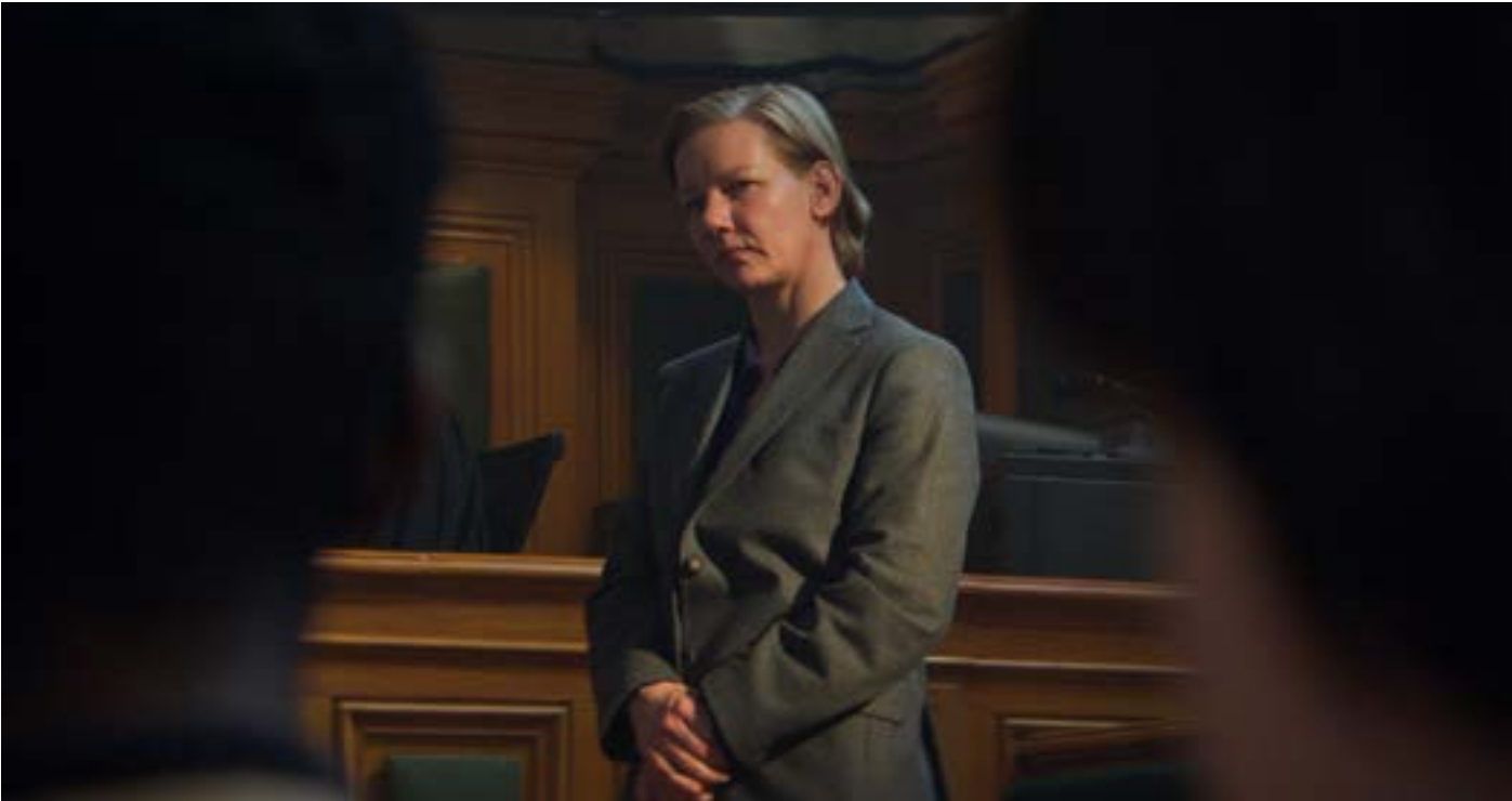
Anatomy of a Fall by Justine Triet