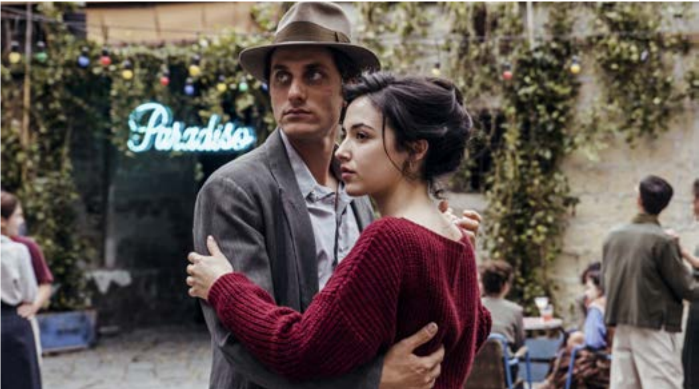
Martin Eden by Pietro Marcello