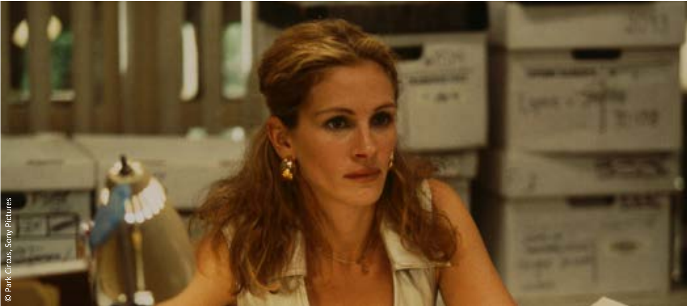
Erin Brockovich by Steven Soderbergh

A short films programme for the whole family, recommended for ages 4 and up Why do some people have more than others? Why is life sometimes so... unfair? Through three poetic, funny, or mischievous short films, this programme invites children to explore the feeling of injustice that can be so revolting. Benshi offers a unique selection of animated short films that give a voice to the little ones facing the big ones, the clever ones facing the powerful ones, the dreamers facing the norms. An invitation to reflect on the world around us, to question power relations and to believe in our ability to transform them.