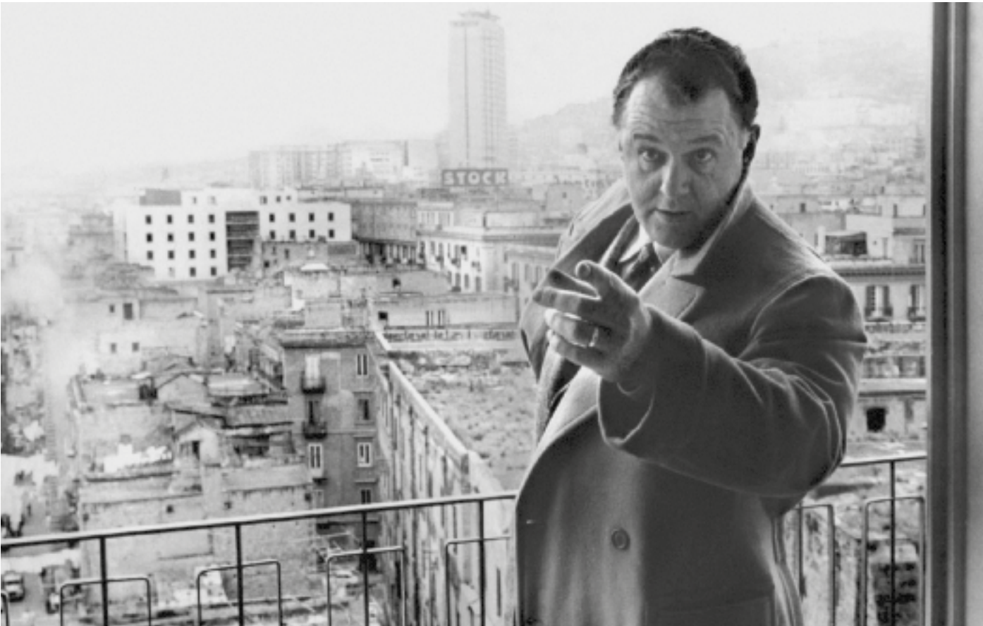
Hands Over the City by Francesco Rosi