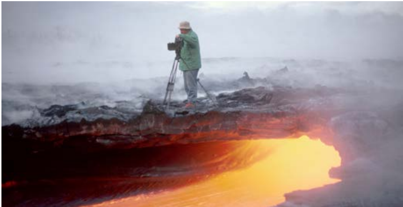
The Fire Within: Requiem for Katia and Maurice Krafft by Werner Herzog