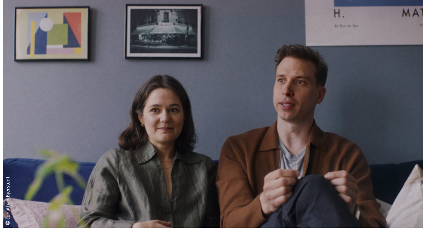
Sous hypnose by Ernst De Geer