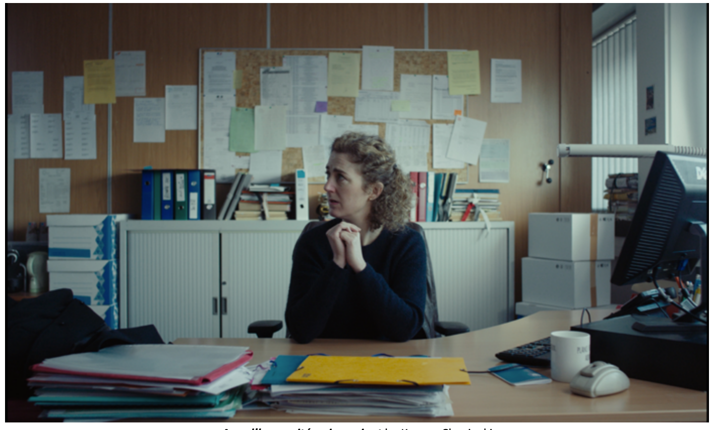
Avec l'humanité qui convient by Kacper Checinski