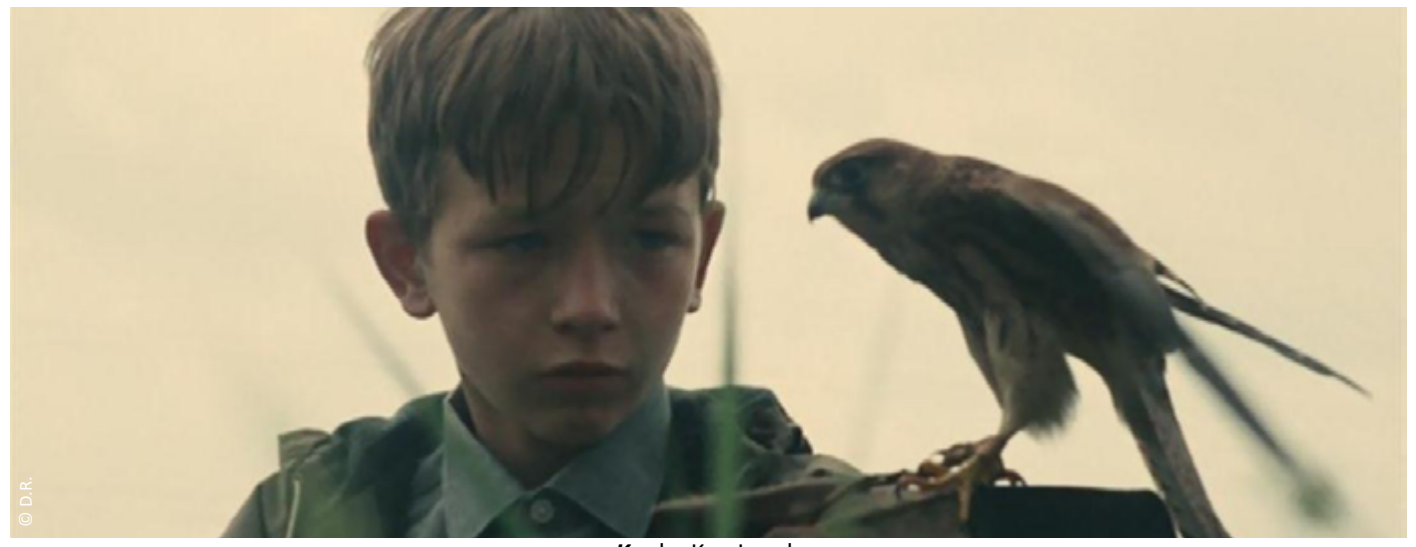
Kes by Ken Loach