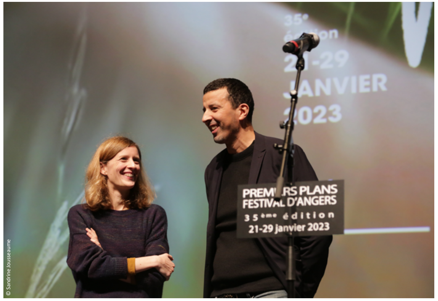
Mia Hansen-Løve and Samir Guesmi at Premiers Plans in January 2023

By focusing on the discovery of new talents in European cinema and on revealing its cultural heritage, the Festival Premiers Plans d'Angers has become an emblematic highpoint in the cultural year. It is recognised by artists and professionals alike, is followed by a curious and enthusiastic audience, and supported by a large number of partners and personalities.