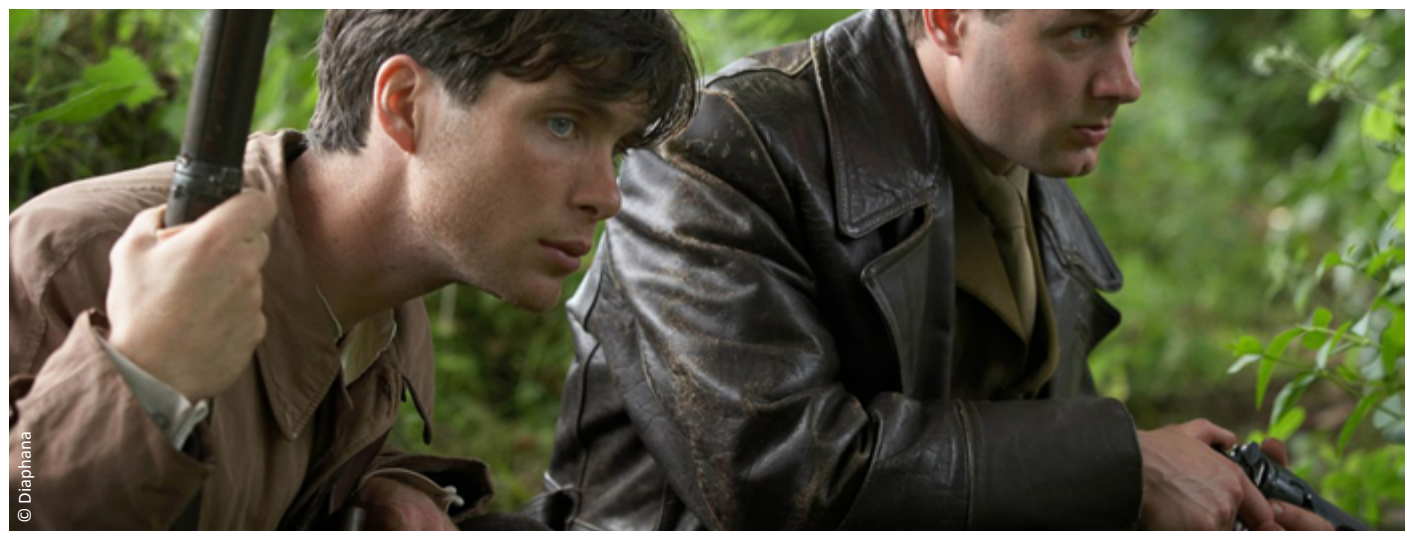
The Wind That Shakes the Barley by Ken Loach