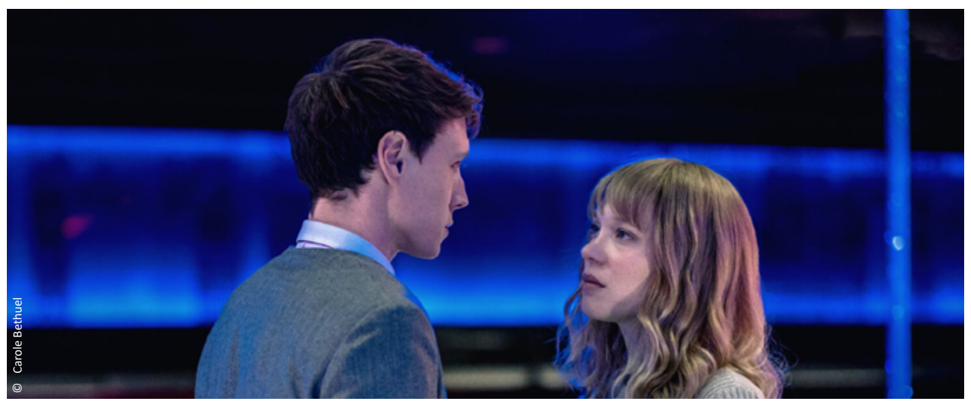
La Bête by Bertrand Bonello