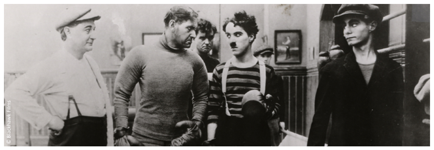
The Champion by Charlie Chaplin