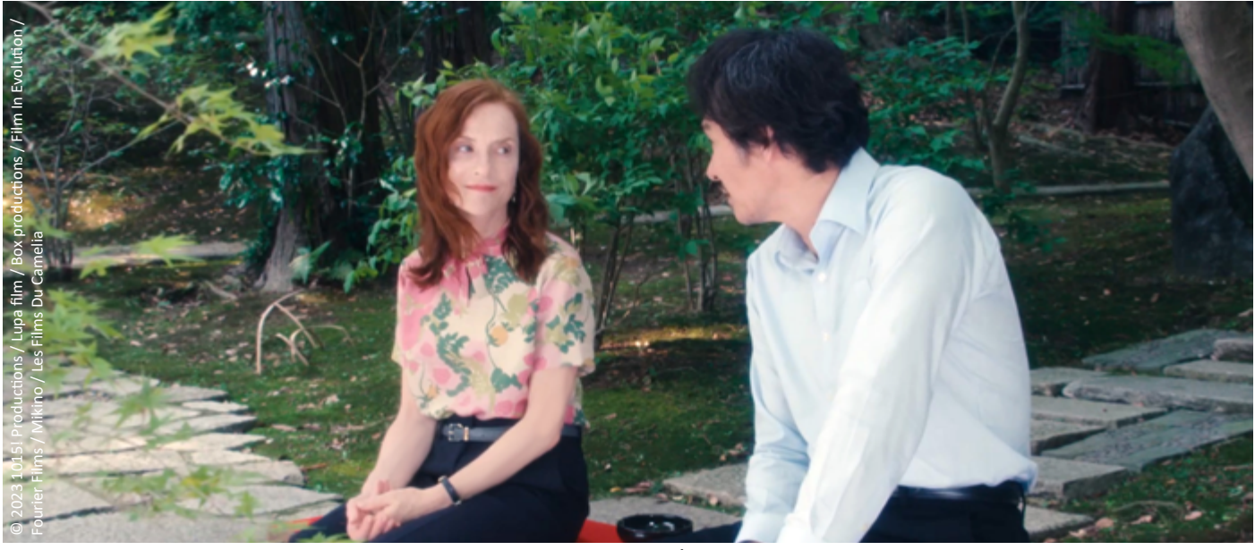
Sidonie au Japon by Élise Girard

Sidonie au Japon Élise Girard 2023 Switzerland / Japan / Germany 95'