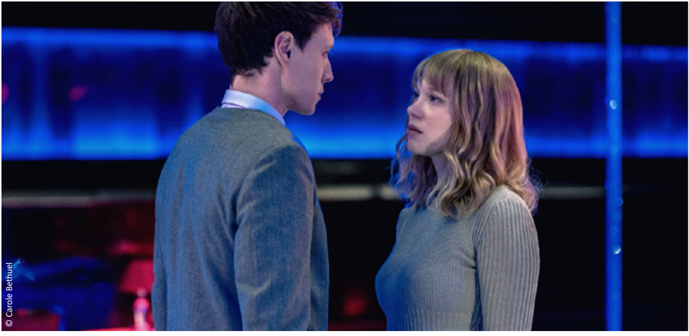
La Bête by Bertrand Bonello