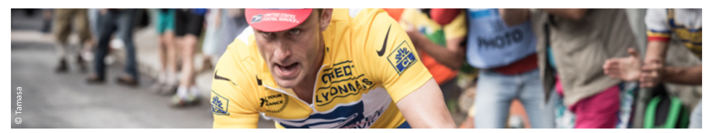
The Program by Stephen Frears

The first Olympic Games of the modern era took place in 1896, just a few months after the invention of cinema. Next January, the Festival will be highlighting the links between sport and cinema through some twenty films of all types (shorts and features, fiction, documentaries, animation) showing different facets of sport in various disciplines (football, boxing, cycling, gymnastics, ice hockey, rugby, skateboarding...).