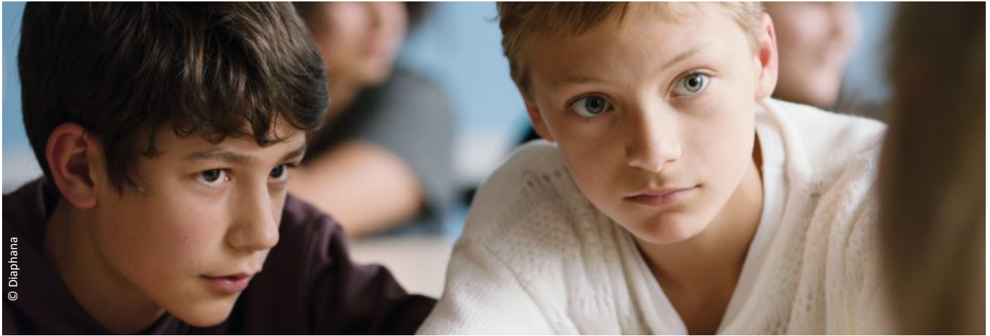
Close by Lukas Dhont