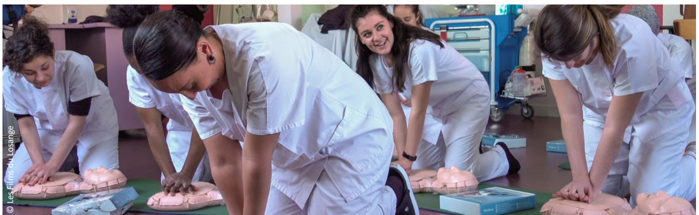
Each and Every Moment by Nicolas Philibert