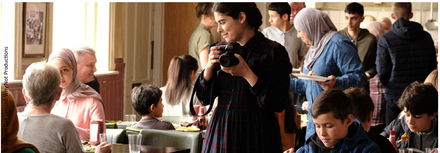
The Old Oak by Ken Loach