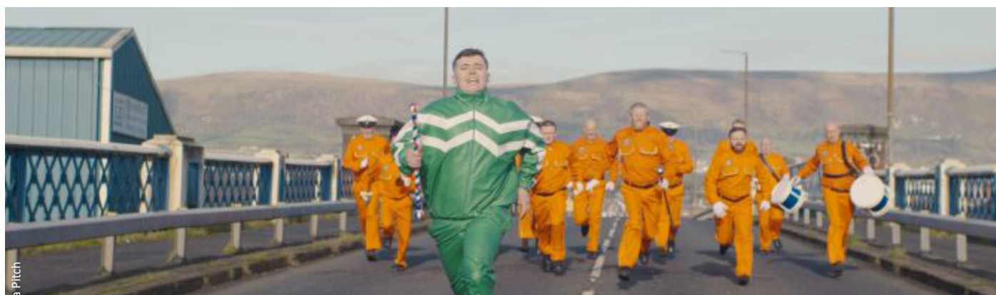
Kneecap by Rich Peppiatt