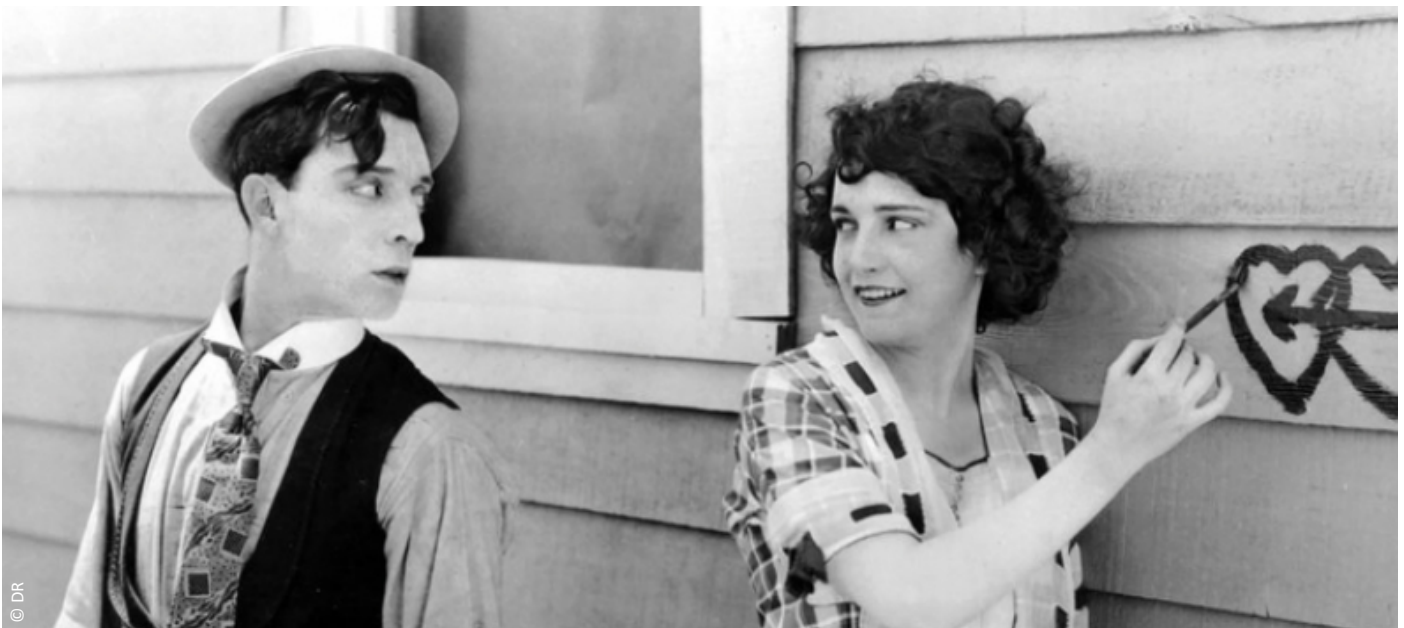
One Week by Buster Keaton, Edward F. Cline

One week Buster Keaton, Edward F. Cline 1920 United States 25' Laurel and Hardy - The Second Hundred Years Fred Guiol 1927 United States 23'