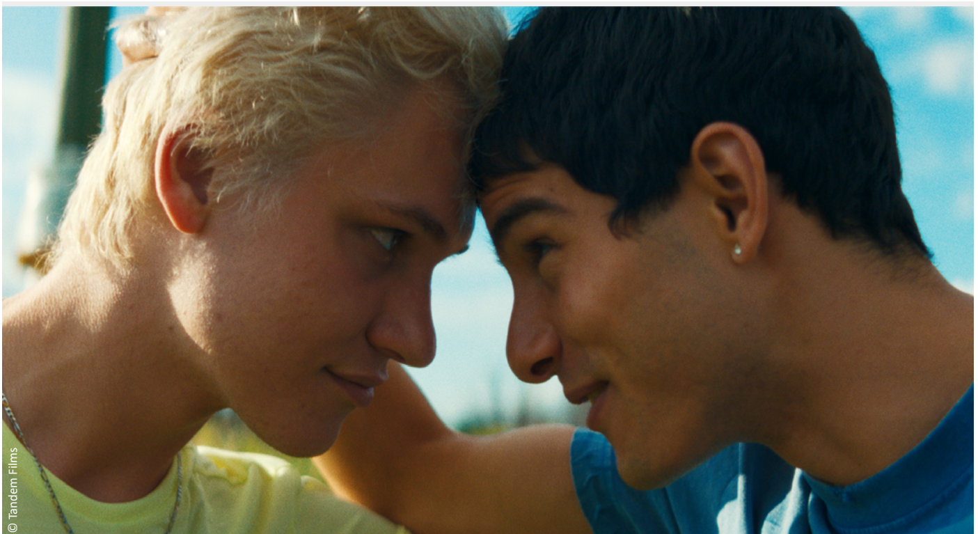
La Pampa by Antoine Chevrollier