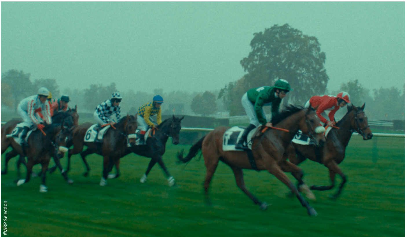
Lads by Julien Menanteau

The opening film ( Attachment ) and closing film ( Les Règles de l'art ) are also previewed.