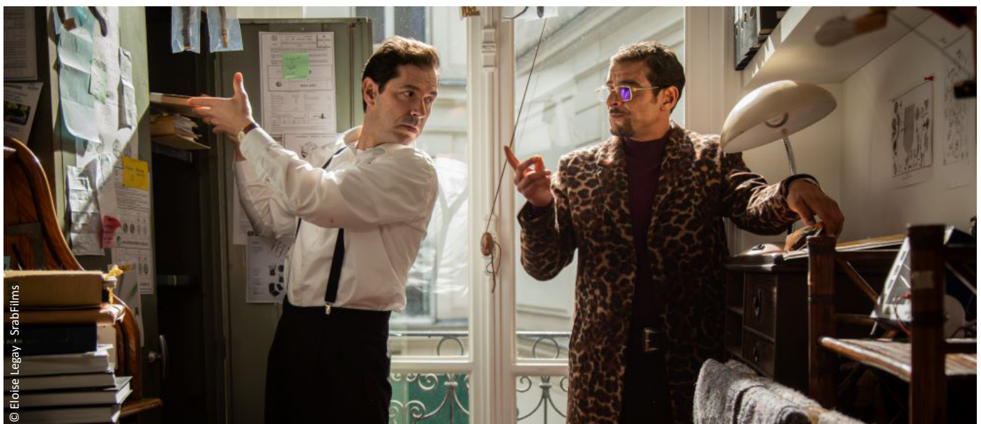
Les Règles de l'art by Dominique Baumard