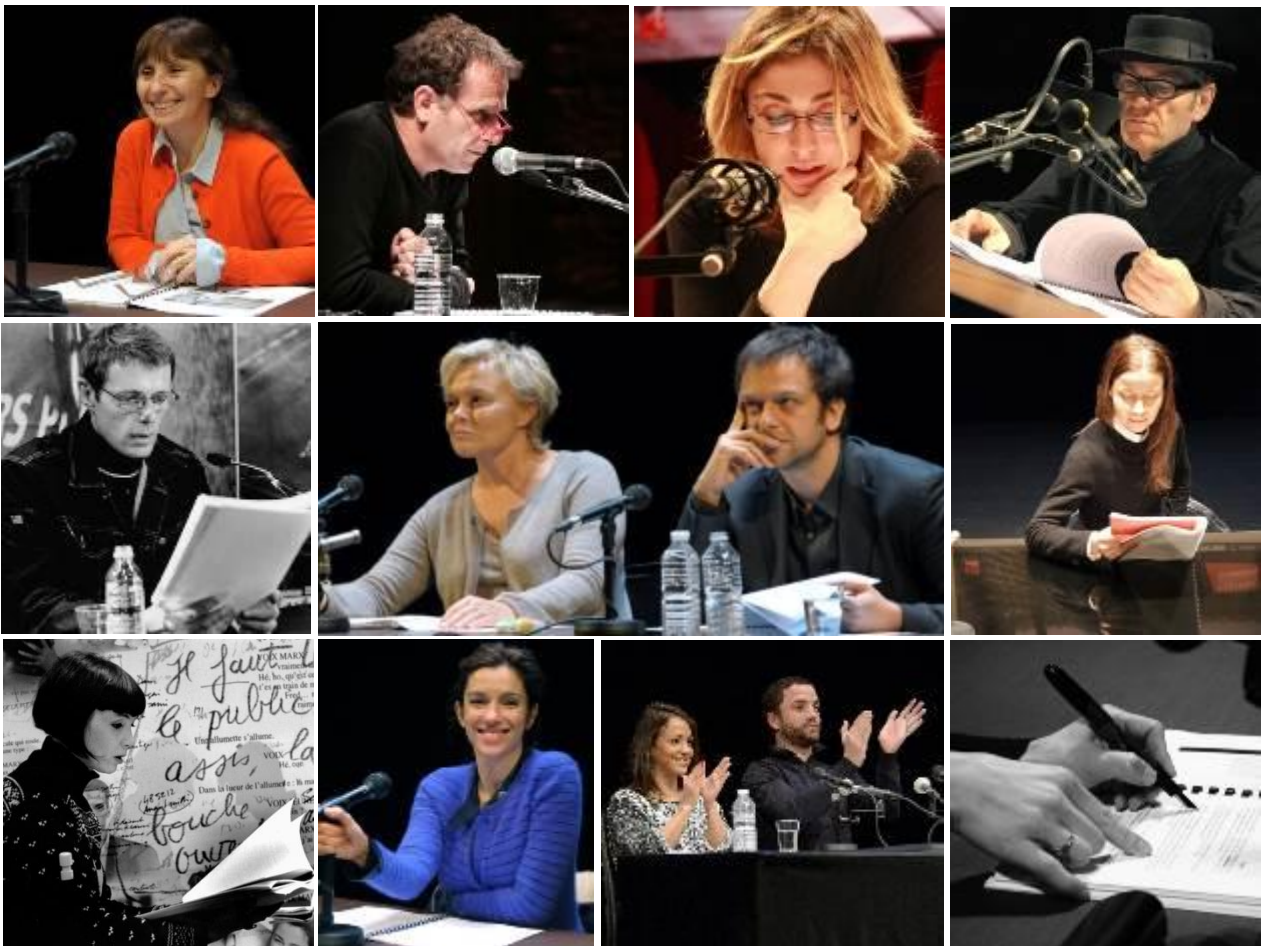
Ariane Ascaride (2011), Charles Berling (2007), Julie Gayet (2009), Tchéky Karyo (2010) Lambert Wilson (2005), Muriel Robin and Jonathan Zaccàï (2012), Dominique Reymond (2013) Sabine Azéma (1995), Aure Atika (2011), Alice Belaïdi and Guillaume Gouix (2014)