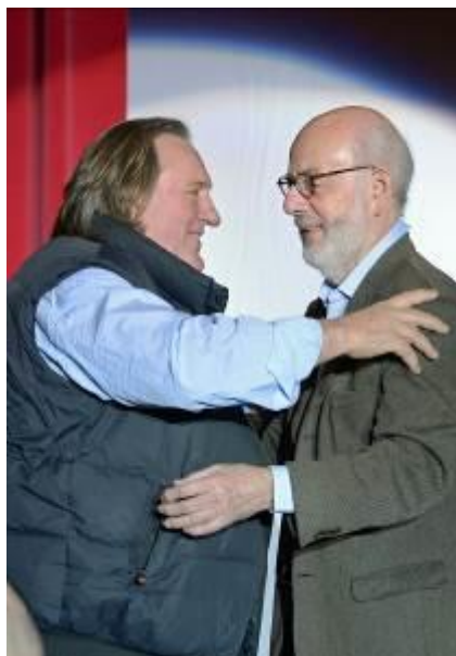
Gérard Depardieu and Bertrand Blier