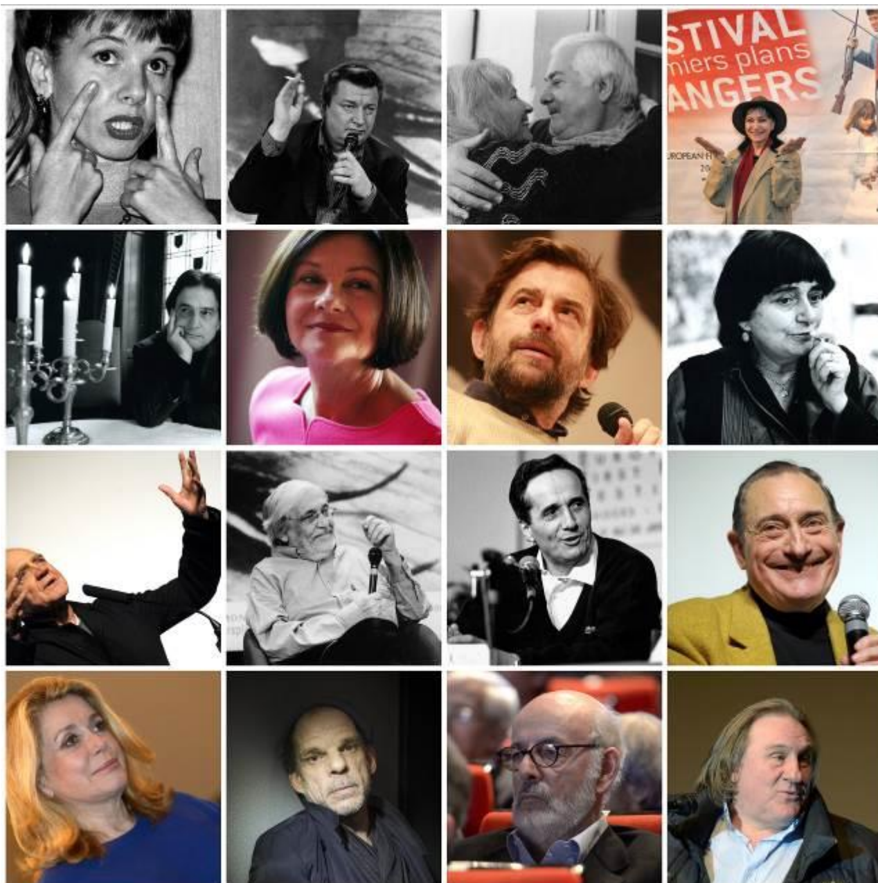
Victoria Abril, Aki Kaurismäki, Gunnel Lindblom et Jean-Claude Brial, Anna Karina, Jean-Pierre Léaud, Macha Méril, Nanni Moretti, Agnès Varda, Bruno Ganz, Maurice Pialat, Marco Bellocchio, Pierre Étaix, Catherine Deneuve, Denis Lavant, Bertrand Blier, Gérard Depardieu.